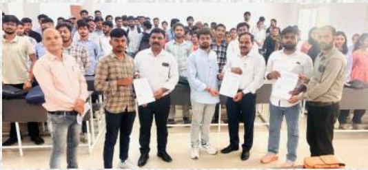
Faculty members from the Department of Business Management and Entrepreneurship providing guidance to BBA students selected for summer internships.