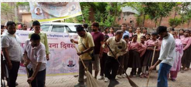
University students, NSS volunteers, teachers, and villagers participating in the sanitation awareness march and cleanup drive organized in Mumtaz Nagar.

Ayodhya, May 1, 2026. On the occasion of Gujarat Foundation Day, Avadh Univer-